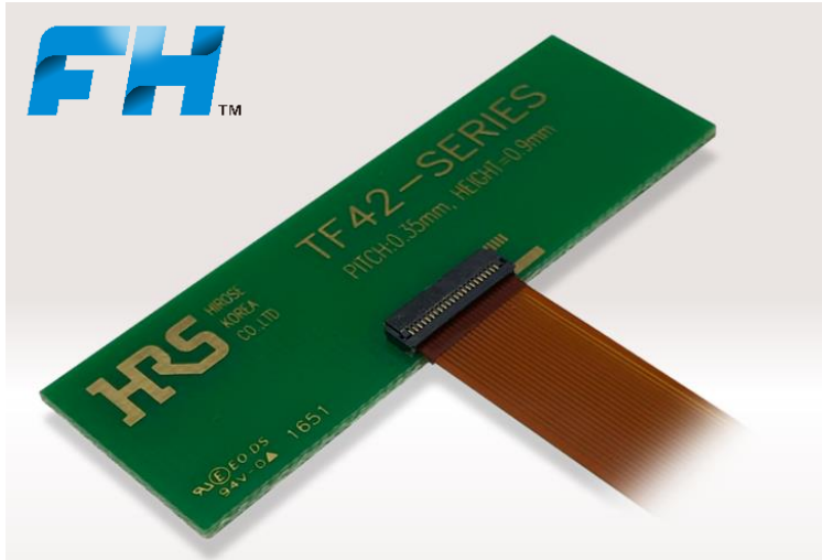
FH Flip-Lock Pioneer Hirose