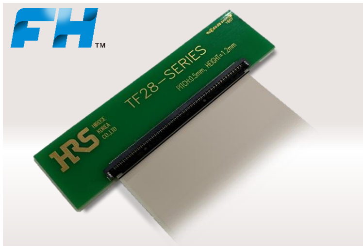
FH Flip-Lock Pioneer H irose