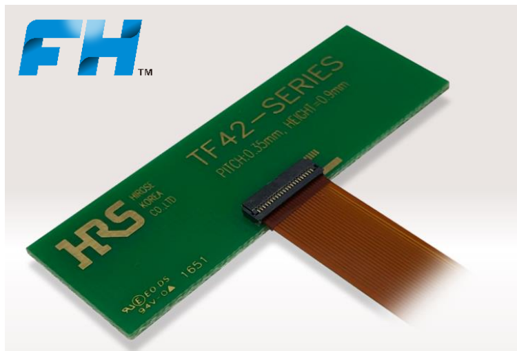
FH Flip-Lock Pioneer Hirose