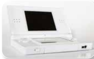
Portable Game Device