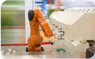
Industrial Control Unit