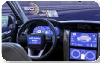
Heads Up Display